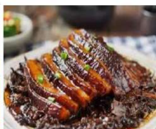
Hotel Buffet Dinner