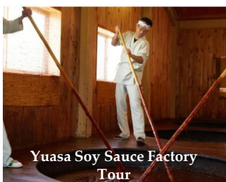
Yuasa Soy Sauce Factory Tour

Transfer to the airport for your flight back to Singapore