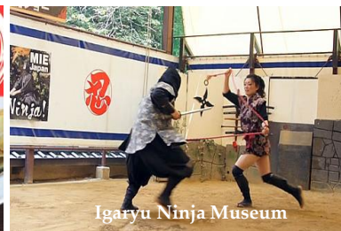
Igaryu Ninja Museum