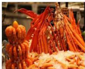
Hotel Buffet Dinner