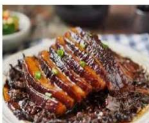
Huizhou Hakka Cuisine