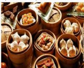
Canton Dim Sum