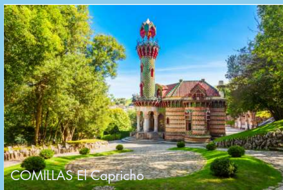
COMILLAS El Capricho