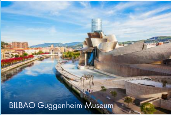
BILBAO Guggenheim Museum