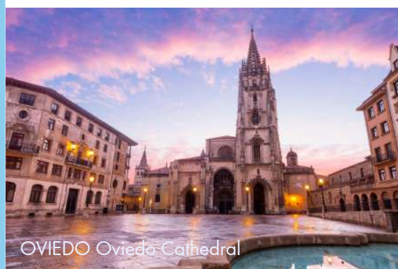
OVIEDO Oviedo Cathedral