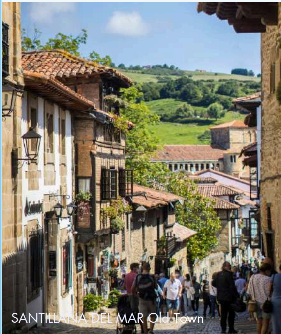
SANTILLANA DEL MAR Old Town