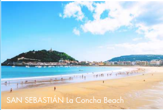
SAN SEBASTIÁN La Concha Beach