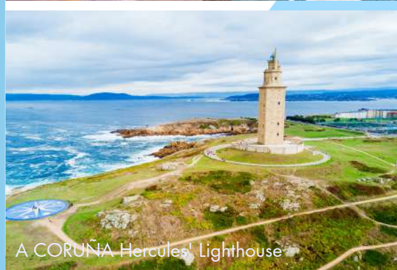
A CORUÑA Hercules' Lighthouse