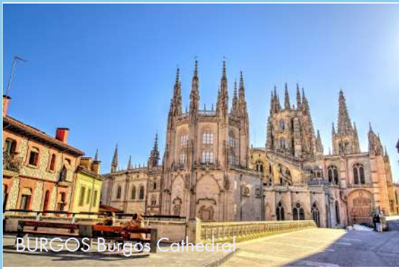
BURGOS Burgos Cathedral