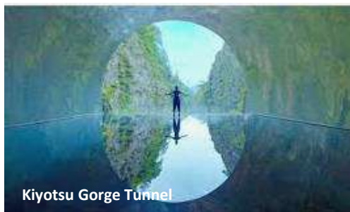
Kiyotsu Gorge Tunnel

It is a beautiful valley that is nationally recognised as one of the Places of Scenic Beauty, and it's also a National Monument. Kiyotsu Gorge has unique blocky cliffs that line the stream that flows through the valley, which makes for a picturesque scene. The valley was formed after a volcano erupted 16 million years ago, and a river slowly eroded the rocks over millenniums.