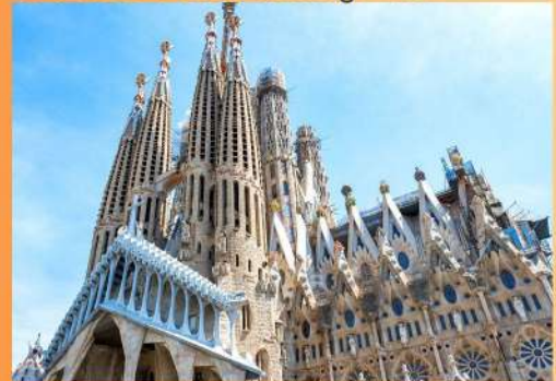
BARCELONA, LA SGRADA FAMILIA UNESCO World Heritage Site