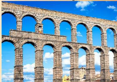
SEGOVIA, ROMAN AQUEDUCT UNESCO World Heritage Site