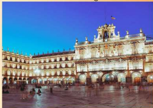
SALAMANCA, PLAZA MAYOR UNESCO World Heritage Site