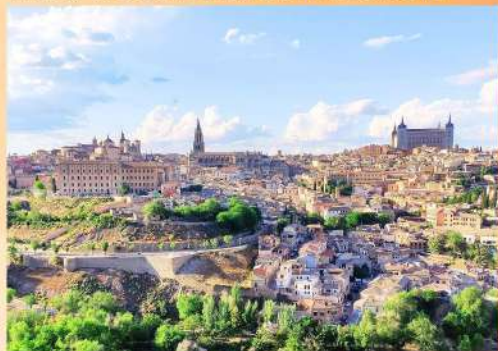
TOLEDO, ANCIENT CAPITAL OF SPAIN UNESCO World Heritage Site