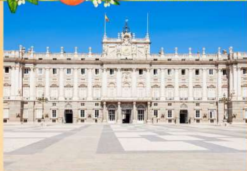
ROYAL PALACE OF MADRID THE LARGEST PALACE IN EUROPE