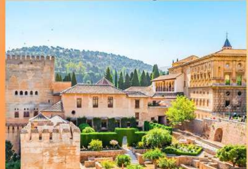
GRANADA, ALHAMBRA PALACE UNESCO World Heritage Site