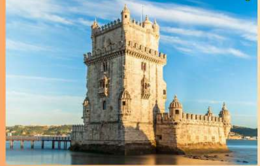
LISBON, BELEM TOWER UNESCO World Heritage Site