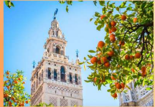
SEVILLE CATHEDRAL UNESCO World Heritage Site