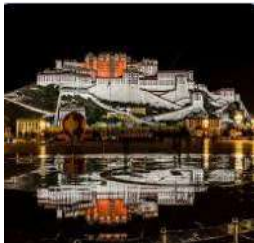
Potala Palace at Night