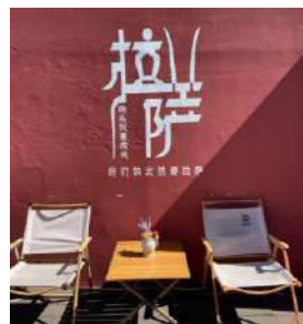
Lhasa Old Town Tea House + Afternoon Tea Section